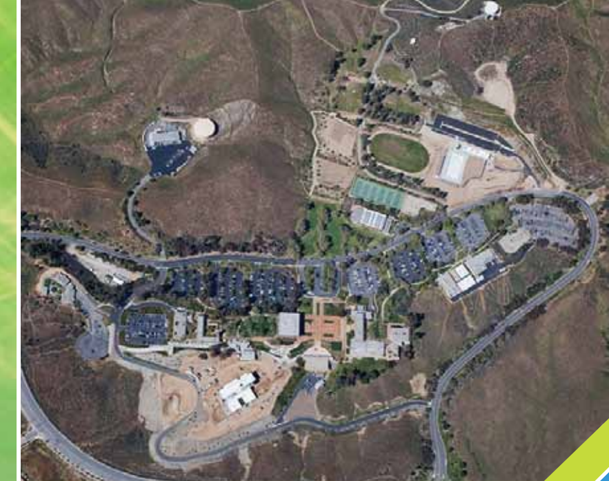
CRAFTON HILLS COLLEGE