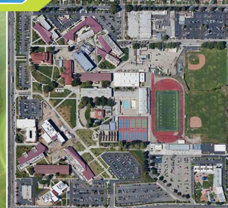
SAN BERNARDINO VALLEY COLLEGE